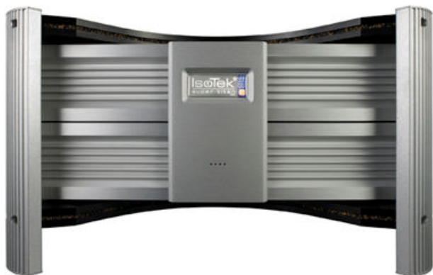
Above: IsoTek Super Titan power conditioning unit